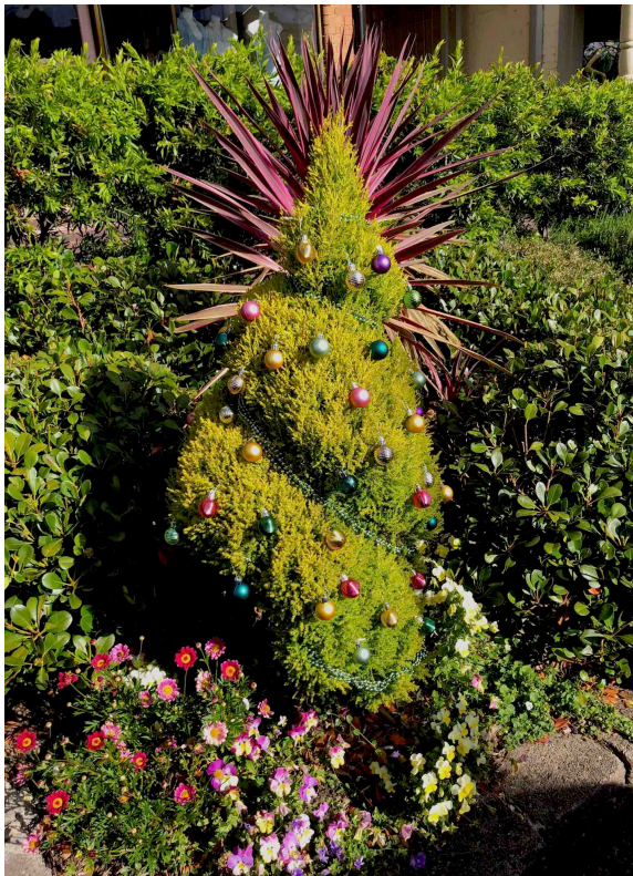
Festooned dwarf conifer outside Woollies.